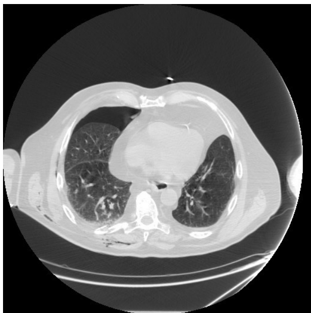
Figure 1. Computed tomography scan section of the lower thorax showing pneumothorax, rib fracture and subcutaneous emphysema

forces involved. The identification of pneumoperitoneum after a blunt thoracoabdominal trauma is associated with perforation of hollow viscus in the vast majority of cases, however the air may come from different parts of the body following a pressure gradient to the abdominal cavity (1-3).